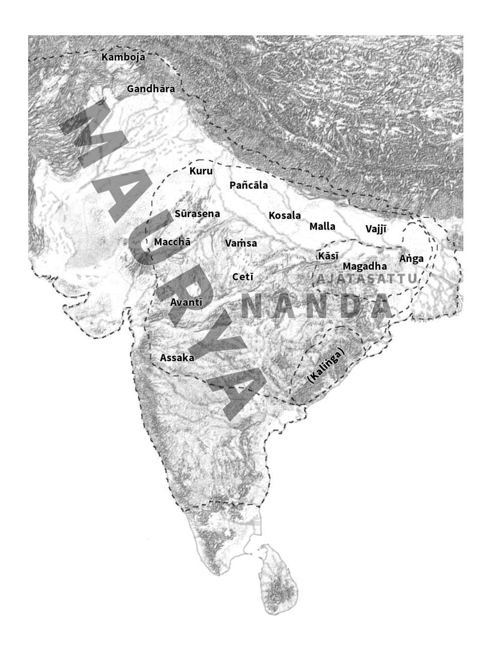
Figure 1.1: The 16 nations and the expansion of Magadha under Ajātasattu (c. 400 BCE), Mahāpadma Nanda (c. 350 BCE), and Candagutta Maurya (c. 300 BCE).